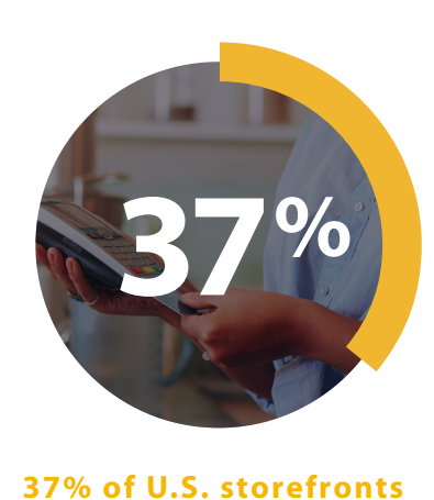
now accept chip cards