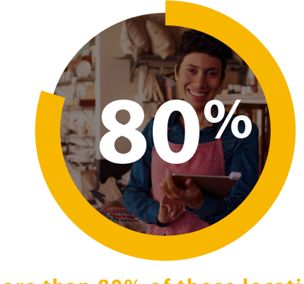
More than 80% of those locations are small and medium-sized businesses